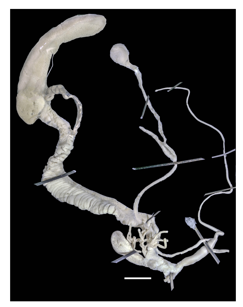
Fig. 4. Reproductive system of Helix cincta from Rhodes isl., Afantou north at Psalidi hill (locality 9). Scale bar 5 mm