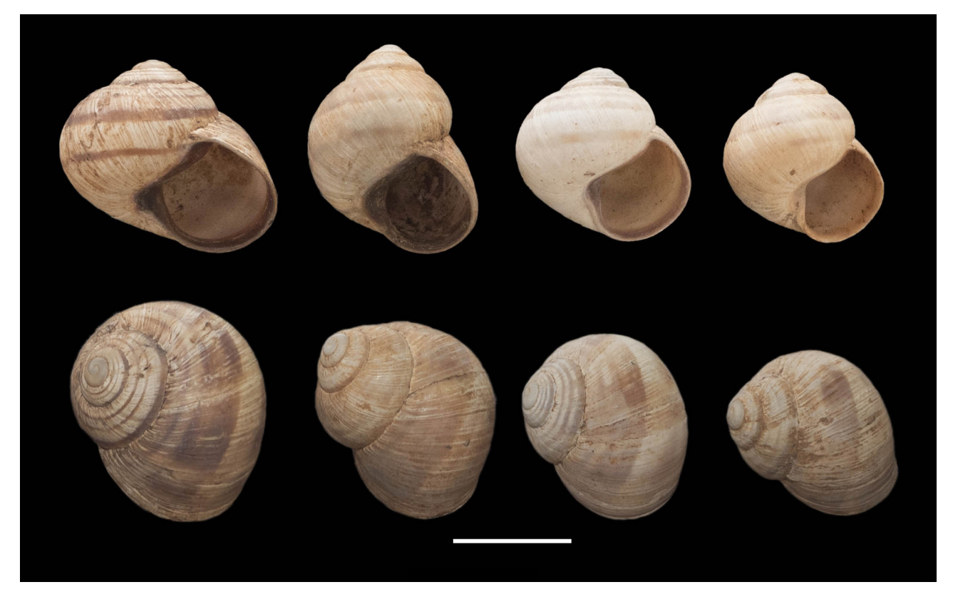
Fig. 3. Population variability of colour, shell shape and shell size of Helix cincta Rhodes isl., Afantou north at Psalidi hill (locality 9). Scale bar 20 mm

PAGET (1971) and FRANK (1997) recorded H. go-detiana from Rhodes based only on one very old shell. We therefore consider that Helix godetiana recorded near Lindos should not be included in Rhodes' extant species list.