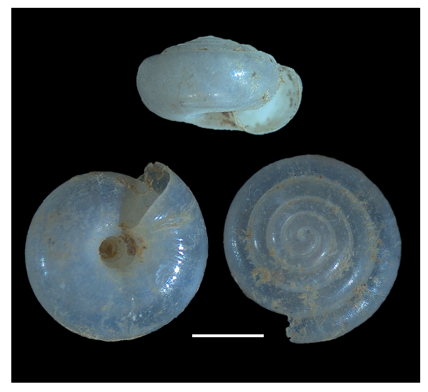
Fig. 2. Shell of Vitrea sossellai from Symi at Moni Mikros Sotiras (locality 13). Scale bar 1 mm