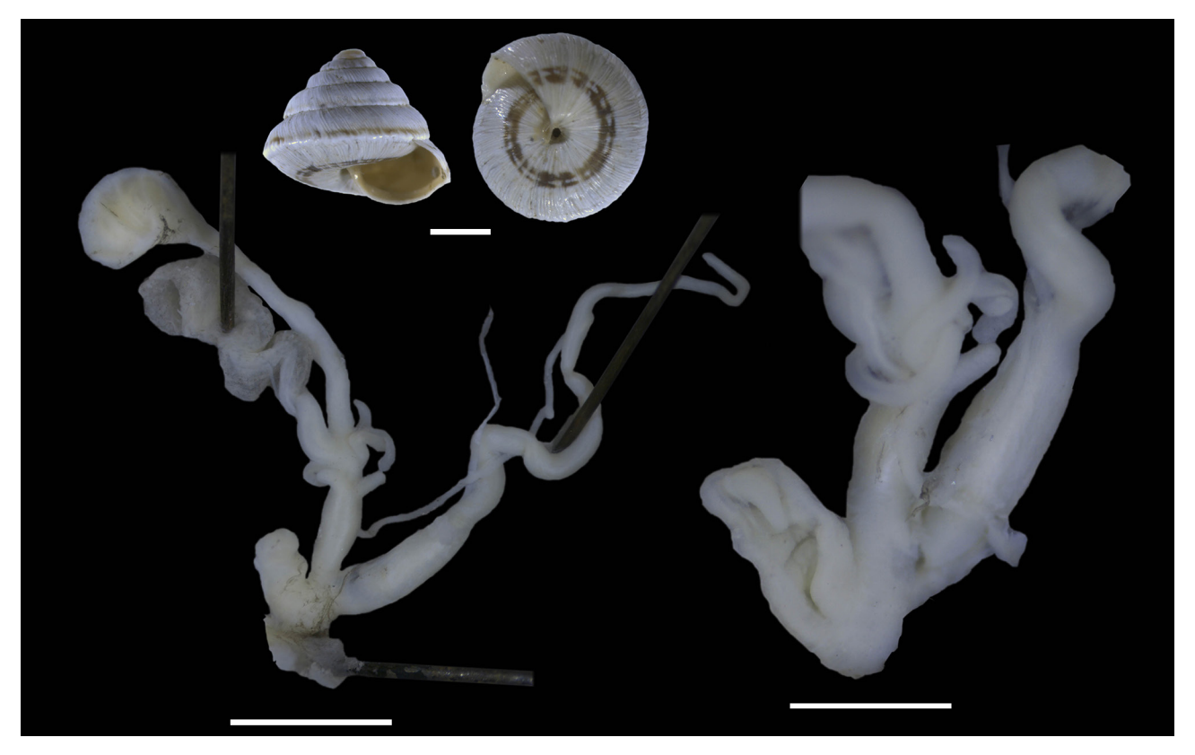
Fig. 5. Shell and reproductive system of Trochoidea pyramidata from Rhodes Island, Filerimos, north foothill (locality 3). Scale bars 2 mm (upper and lower left) and 1 mm (lower right)

Rhodes Island, with the exception of the GBIF and Naturalis Biodiversity Center records, which are from Italy. We have examined many specimens with shells corresponding to the original description of PFEIFFER (1870). There is a great variability in the shells, ranging from shells with a keel to completely rounded last whorl. Based on the genitalia, it is clear that it belongs to the genus Trochoidea due to the presence of an atrial appendix. The atrial appendix has a crest-like structure which apically is smooth (Fig. 5). This, according to GIUSTI et al. (1995), is characteristic of T. pyramidata and not of T. trochoides (Poiret, 1789). Thus, our specimens from Rhodes belong to T. pyramidata, and consequently H. verticillata (and all its subsequent combinations) is a synonym of T. pyramidata and should not be included in the species' list of Rhodes.